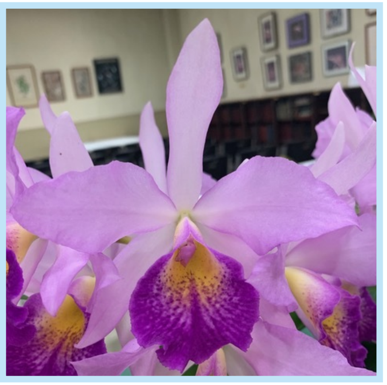
Pot. Dogashima Paradise 'Strawberry' AM-AOS